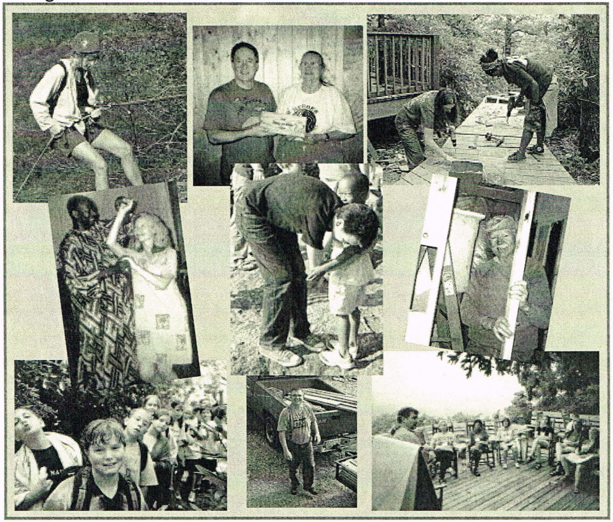
participating in the creation of a transformed society.