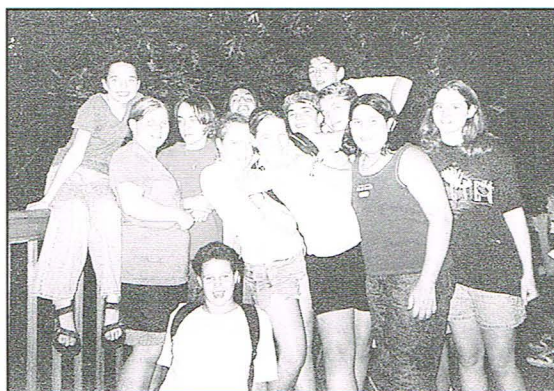
A group of happy 2001 youth campers!

Youth programs are about the joy of being together in community, experiencing the way people CAN and MUST learn to be together in this world. Our programs always have been about children learning who they are and how they impact the world. Here we give youth the tools to make that impact positive and rewarding. It is a thrill to create the interdependent web of vibrant camps, CONS and the dynamic, young Milestone programs. Now, watch us grow together!