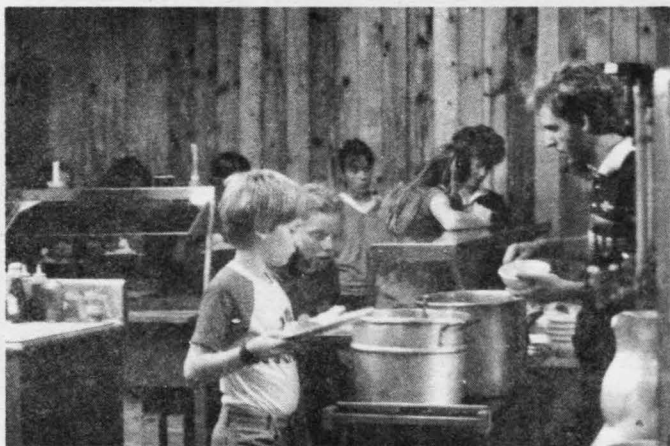
Good food and hearty appetites abound at THE MOUNTAIN.

Our DREAM includes 1) paying off our mortgage, 2) repairing or replacing existing buildings and equipment, 3) establishing a contingency reserve fund for emergencies, and 4) continuing to provide you with the most appealing programming available. Contact Mo and Larry Wheeler for a brochure or the name of your area coordinator. All memberships are tax deductible. You, too, can SHARE THE DREAM.