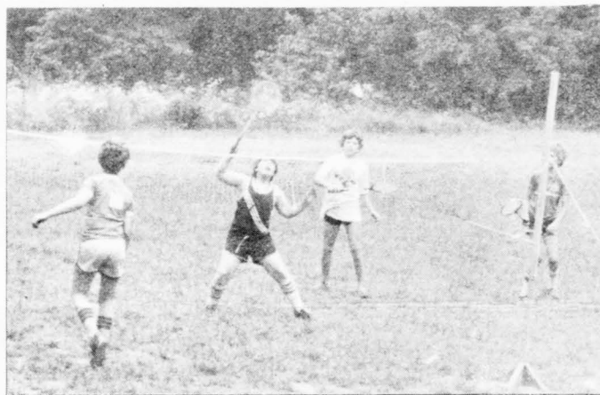
active team games,