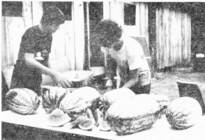
. . . a taste of fresh, juicy watermelon.