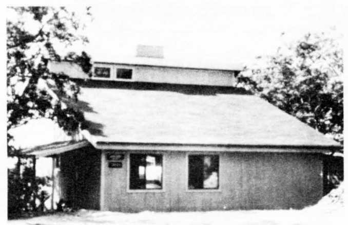
New Directors' Home and Office