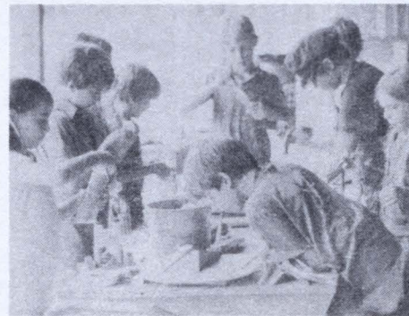
Youth campers trying their hands at art and crafts.