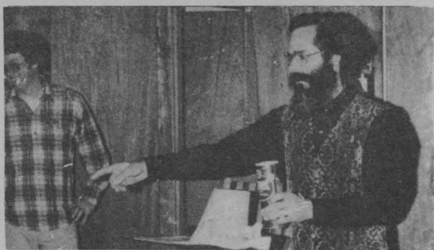
Would you believe a can of Institutional Comet?

An endless number of volunteers (too many to name) helped with this project along with our maintenance crew. To all of you who helped by working or contributing funds, we thank you. You will benefit during cold times from a nice warm building.